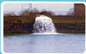
Trenton Reservoir was originally constructed between 1895 and 1899.

The reservoir supplied 9 to 10 pressure zones in the distribution system. In 1957, the Central Pumping Station was built and the reservoir became the supply source for the Central Pumping Station—which in turn supplies the distribution system. The reservoir can hold approximately 104 million gallons of water and has a surface area of about seven acres. In 1975, there was a major water crisis in the City of Trenton due to a mechanical failure at the filtration plant. While the City was trying to repair the damage, the stored water in the reservoir was used to supply water to the residents for several days. Currently, there is a design effort in progress to install a cover over the reservoir to maintain treated water quality.